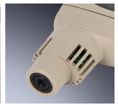
PosiTector DPM IR probe includes infrared surface temperature sensor.