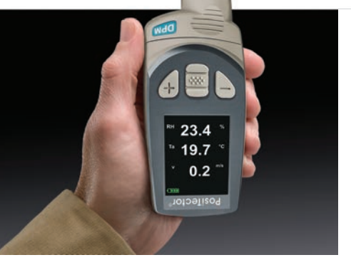
Flip Display enables right-side-up viewing in any position. PosiTector DPM A shown.

Hot-wire anemometer with your choice of wind speed measurement units — m/s, km/h, mph, ft/s, ft/m, knots. DPM A models only.