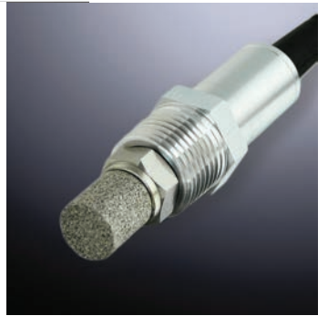
PosiTector DPM D probe includes 1/2" NPT threads for insertion into pipes.