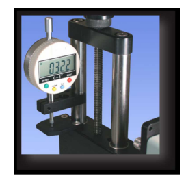
Digital travel indicator